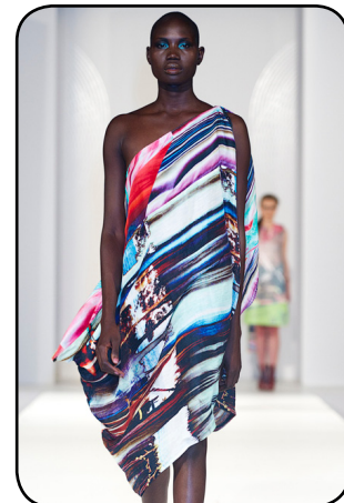
No waste fashion concepts