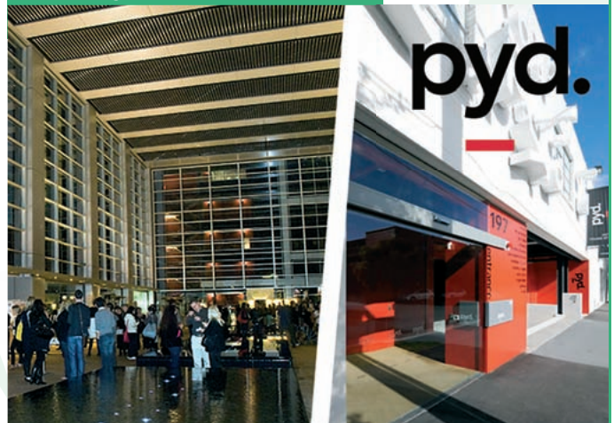
SRD Change10 venue at pyd. 197 Young St. Waterloo