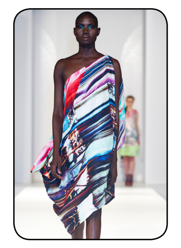
No waste fashion concepts