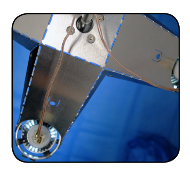
12volt LED Surgical Lamp

SRD supports and promotes collaboration between educators of all design streams, designers using sustainable responsible design practices, companies embracing corporate responsibility, manufacturers and the public. By doing so we advance information, research and education for significantly better built and living environments, products, services and resource management.